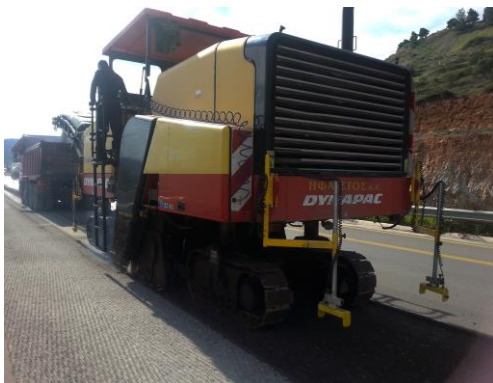
Big Sonic-Ski installed on the milling machine

With more than 40 years of experience in the development and manufacture of measurement and control technology, identification and weighing systems for construction machines and waste disposal vehicles, MOBA is a globally recognised expert in the field of mobile automation. MOBA is one of the leading system specialists and OEM partners in the industry. With headquarters in Limburg, branch offices in Dresden, Langenlonsheim and Merenberg, eleven subsidiaries and equity stakes in local enterprises, and an extensive international dealer network, MOBA has a presence in all important growth markets. Company sales grew over the past decade from 26 million euros in 2004 to more than 54 million euros in 2014; the number of employees increased in this period from 210 to 482.