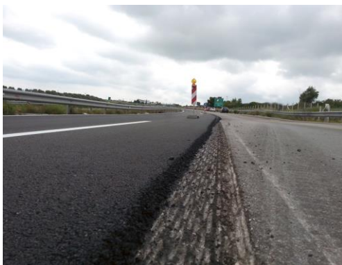
By milling the substrate surface down evenly, you can achieve a more accurate result at the asphalt paving stage of the job